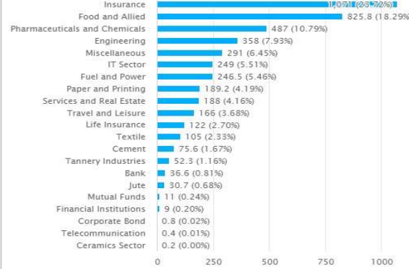
DSE Sectoral Comparison today in turnover (In Mn BDT)